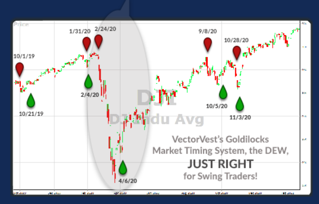
...And signaled aggressive investors to begin stepping back in just two days after the market bottom!

The VectorVest Market Timing System and the DEW Timing Signal contain the KEY TO A SAFE RETIREMENT for you and your family.